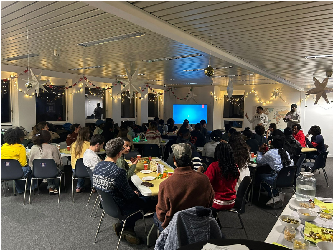
Above: flyering for our evangelistic Christmas event at GBU Brussels South; the night itself (which included at least five students who came from receiving a flyer and many more guests).