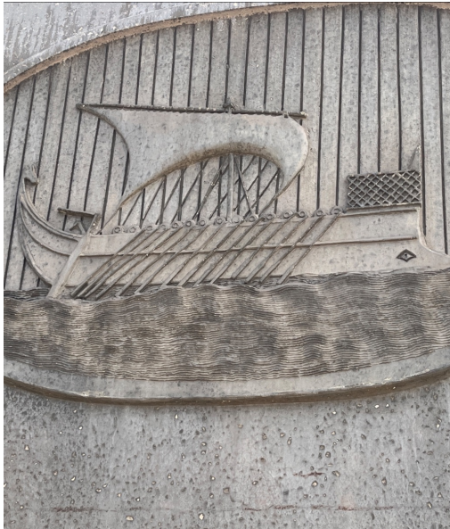
Image of a Phoenician boat we found while exploring our city that Bec was able to share while using wayfinding as an analogy for leading through uncertainty.