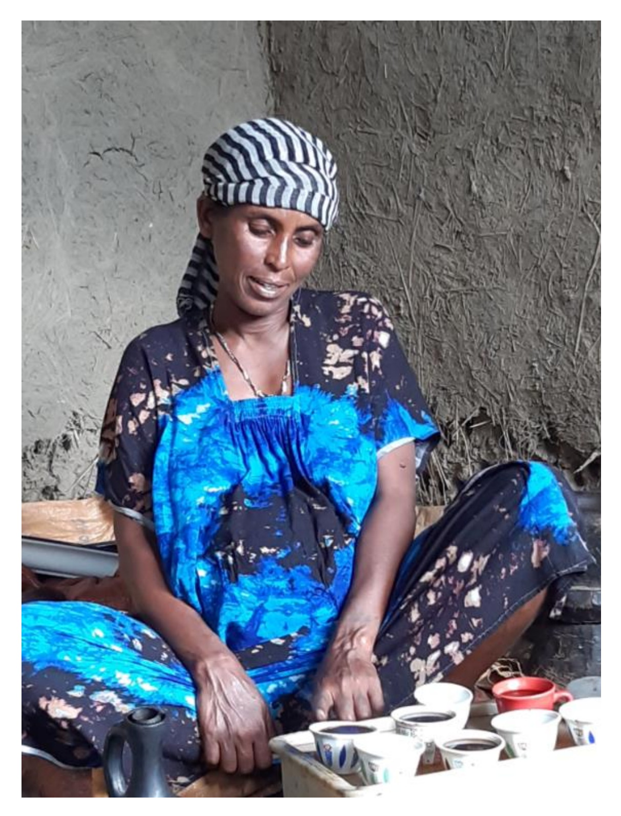
This woman represents the kindness shown to those who come seeking refuge and rest. Drinking coffee is a unifying tradition across Ethiopia that indicates peace.

her child was crying with hunger. She declared "You have seen us. Why do you love us so much?" She was able to hear the great story of God's love, compassion and mercy shown through Jesus. We give thanks the woman and her family could rest with God's people during the chaos. We pray that they know the ultimate rest that comes through King Jesus.