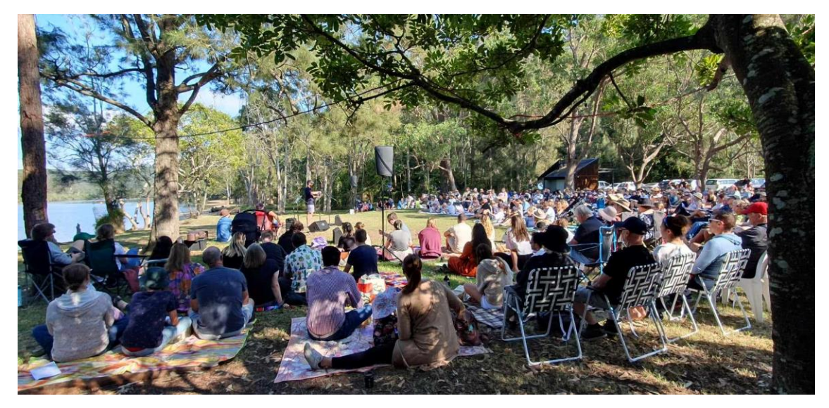
Soul Revival Easter service at Swallow Rock on the Port Hacking River at Grays Point