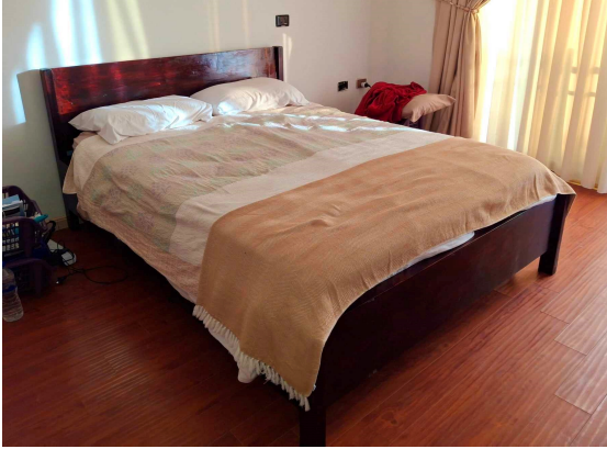
The new bed.