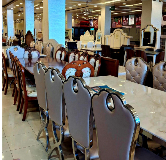
This is what we had to work with.