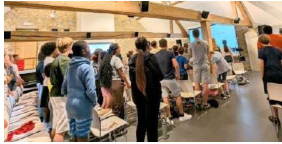
Above: campers hearing testimonies, Michael's boys' dorm Bible study, and bilingual singing (yes, it's possible!) during the daily Bible sessions on Ephesians.