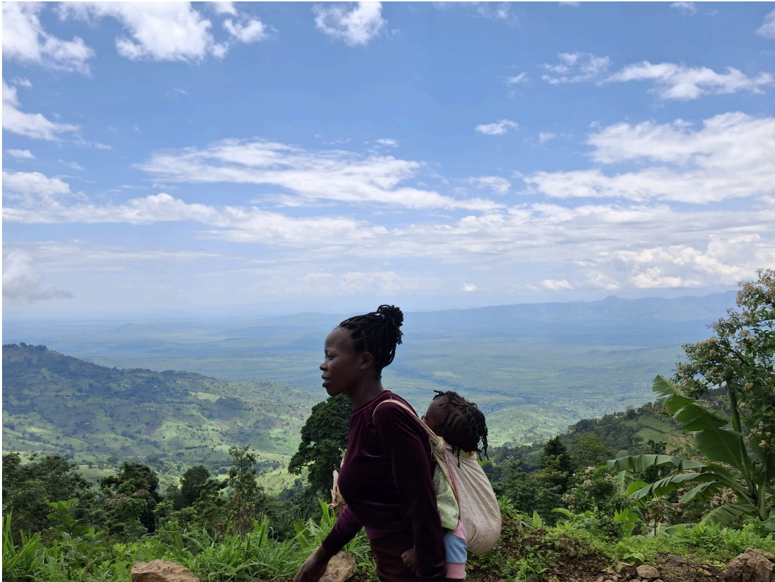
Beautiful surroundings of Wibhammer