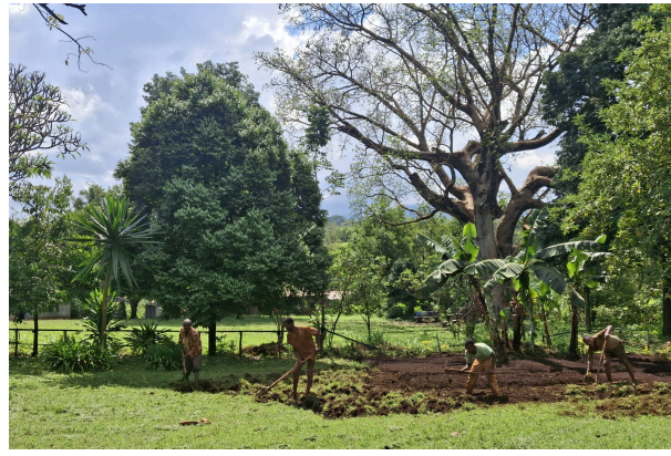
The beginnings of the new garden.

Trudi is establishing a market style garden at our home to demonstrate how the land can be used and be an example to the rest of the college community by putting her teaching into action. The soil is fertile and produces abundantly. A young man named Agelgi (meaning servant of the Lord; a lovely young man who is living up to his name) has been hired to care for the garden, keep the weeds at bay and scare the monkeys away. Fences are needed and many ideas are still to transpire. This is a task in progress with 100 papaya seedlings raising their heads alongside carrots, tomatoes, spinach, garlic, onions, lettuce and a variety of "Australian" foods such as beans, cucumbers, zucchini and orange sweet potatoes. It has been lovely to be able to go to the garden to pick an avocado or mango, eat bananas, flavour with oregano, shallots, rosemary, mint and lemongrass, or drink herbal teas like hibiscus flower or verbena. And all from the garden. We thank God for his provision in this way and pray that others will see and follow in both word and action.