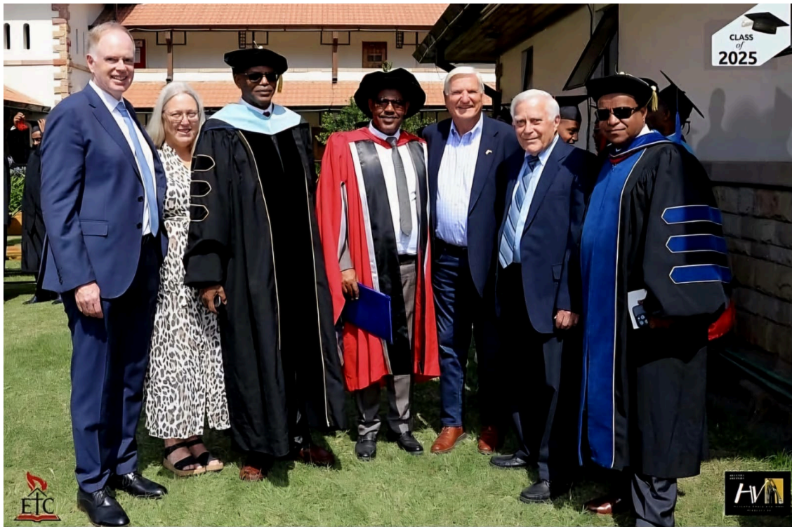
Academic staff at Evangelical Theological College (ETC)