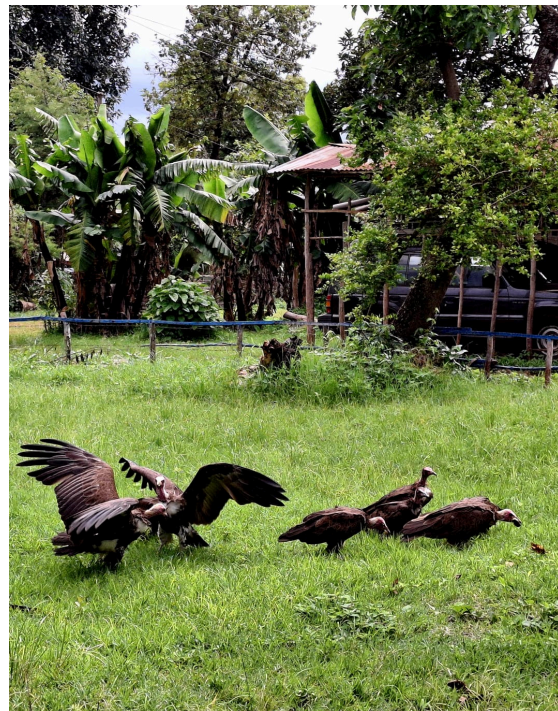
Complete with resident vultures

There is so much need for good Bible teaching here. The Prosperity gospel has infiltrated the evangelical church, only a fraction of the church leaders are trained and the churches themselves don't value Bible College training and prefer the privately owned short courses that have no oversight and are pretty much a 'buy your degree' school.