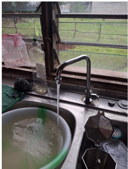
Water problem solving at the spring