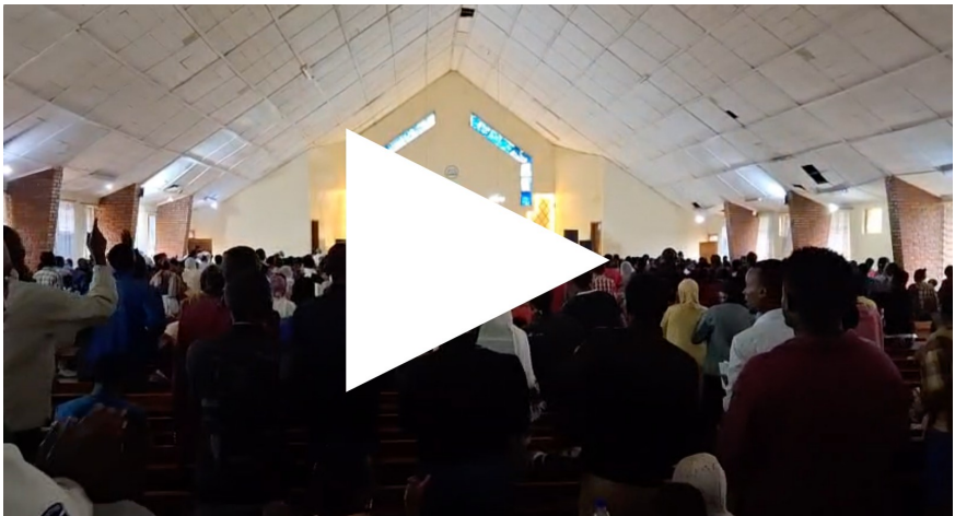
Go to the image above to see a video of children and grown-ups joyfully singing at our church, which holds 1000 people. You can also watch it here .