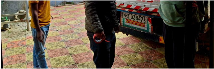
Anthony with the removalist truck

We arrived in Dila with a warm welcome, including a celebration and coffee ceremony from our neighbours and coworkers.