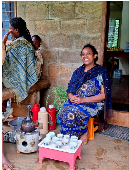
Welcome coffee ceremony