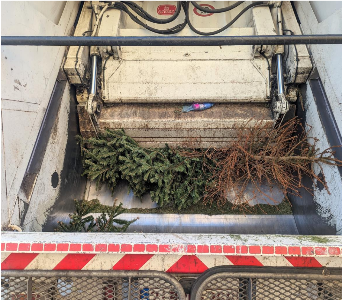
Above - a brutal 'back into it' moment, when everyone throws out their Christmas trees after Epiphany...